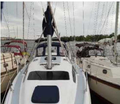
They kept their social distance and each stayed aboard their own boat...but sure enjoyed each other's company.