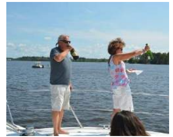
The Renaming Ceremony of course!

Unfortunately our Beaufort Cruise over Labor Day was cancelled due to increased COVID transmission rate and mandatory mask mandate at that location.