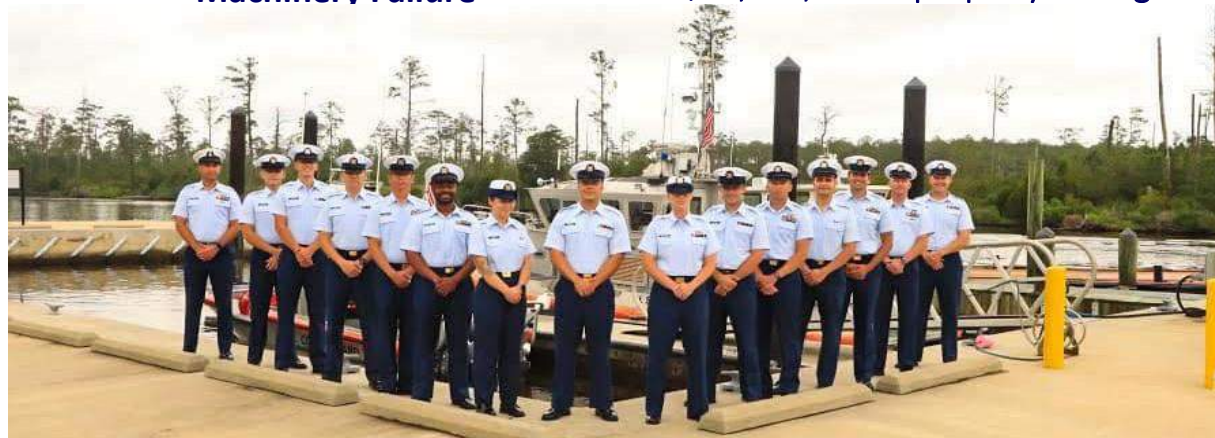
U. S. Coast Guard serving at Station Hobucken

Come for the Boating Education...Stay for the Friends SM