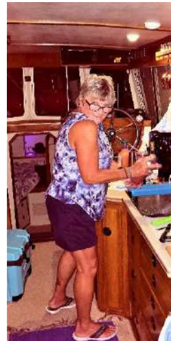
Making Hamilton Daiquiris!

Boating life really IS all its cracked up to be!