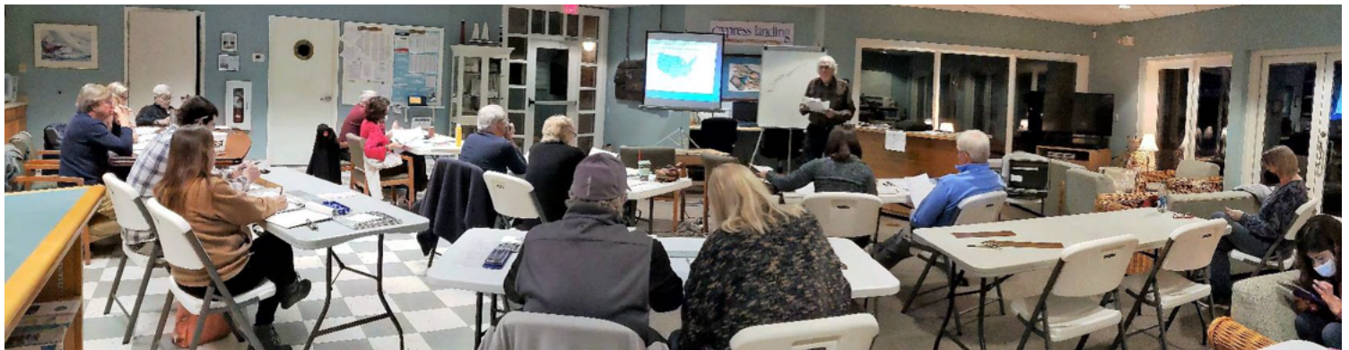
Enthusiastic students at the ongoing Marine Navigation Class that will wrap up March 2 nd .

Let's build our skills, get on the water and enjoy 2022!