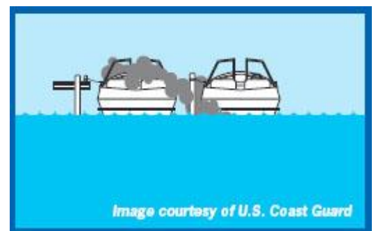
Exhaust from nearby vessels can send CO into your boat's cabin or cockpit.

If you think a person on your boat has CO poisoning move him or her to fresh air right away and contact the nearest emergency services.