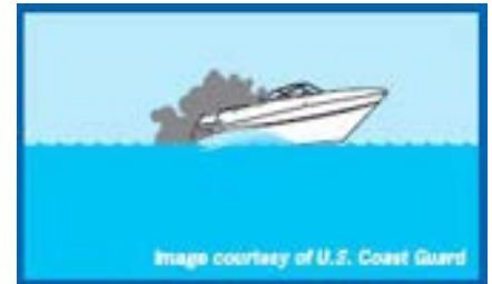
Back drafting can occur when a boat is operated at a high bow angle.