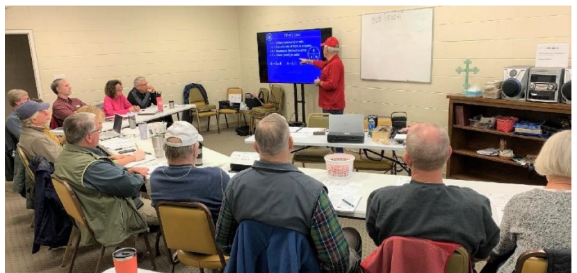
Enthusiastic students during the Marine Electrical Course in January.

We've recently surveyed the club about their education needs and we'll keep those responses in mind as we set up the education program for the year. There will be plenty of classes and seminars to keep us all engaged and learning. Best wishes for a safe and fun 2023 boating season!