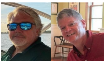
Boating Tips Column Washington Daily News

Fall Cruise to Dowry Creek Marina , November 14 – 16 wraps up the season. Perfect for a winter fuel run and taking in the Social Luncheon at their new restaurant.