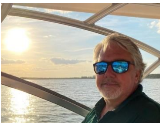
Boating Tips Column Washington Daily News

Nothing new to report and no schedule for a third Town Hall discussion. A finalized detailed implementation plan is still expected to be confirmed by the end of May with the full completion target date set for June 2023