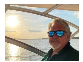
Boating Tips Column Washington Daily News

A finalized detailed implementation plan is still expected to be confirmed by the end of May with the full completion target date set for June 2023.