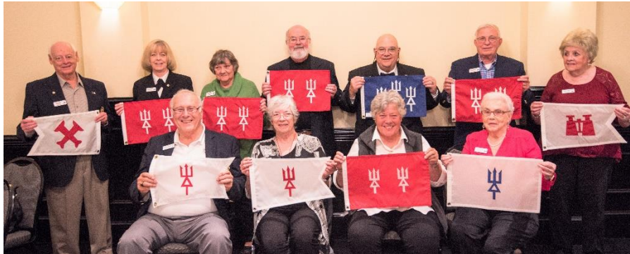
District 27 Bridge Officers for 2023