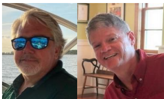
Boating Tips Column Washington Daily News

Explore the 2024 Miami International Boat Show for Water Ways TV live on America's Boating Channel . Tune in for the latest innovations coming now to the boating industry from the largest boat show in the world. Many short videos covering boat manufacturers, yacht groups and vendors. Click on this link to view all: https://www.youtube.com/playlist?list=PLgIbejIMU2HdqB7pJGq3UCxRhWkP2ZXsd