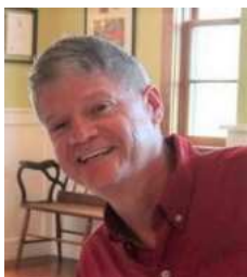
Boating Tips Column Washington Daily News

The District 27 Rendezvous for 2025 is scheduled June 13 & 14 in New Bern. Stay tuned for more details from the host squadron, Cape Lookout. If you have ideas for cruising, continue to let us know there's sure to be others interested in the same destinations.