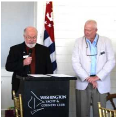
Commander's Award – Planning effort for the D27 Rendezvous