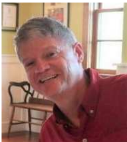
Boating Tips Column Washington Daily News

If anyone has ideas for a day boat plan or a favorite cruise destination, let me know. A collaboration is always best or if you have a spur of the moment idea just because it's a beautiful day, send a notice on Facebook! If you aren't a Facebook member, click on this link and join so that you don't miss a thing. https://www.facebook.com/groups/PamlicoSailAndPowerSquadron